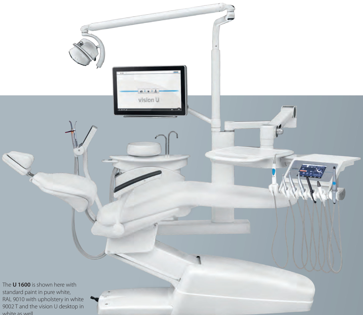
The U 1600 is shown here with standard paint in pure white, RAL 9010 with upholstery in white 9002T and the vision U desktop in white as well.

Because the premium unit U 1600 can be optionally fitted with the innovative vision U multimedia system, you can step right into the future, e.g. by displaying pictures taken with the intraoral camera directly onto the 21.5" touchscreen monitor, manipulating the images with elegant smart-touch gestures or scanning the codes for administration of the patient records.